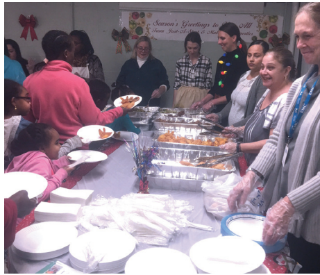
JAS staff serve residents at the annual Holiday Dinner

Consolidated Project: After years of hard work, in December JAS's Real Estate Department closed on the Consolidated Project, a $48 million, 112-unit affordable housing rental preservation project. The project consists of 20 buildings across 10 sites located throughout Cambridge, and marks the first comprehensive renovation of these buildings in the time JAS and its affiliates have owned them. The project is utilizing funds from MassHousing and the Cambridge Redevelopment Authority, as well as tax-exempt bond financing from the Commonwealth of Massachusetts and Low Income Housing Tax Credit (LIHTC) Equity.