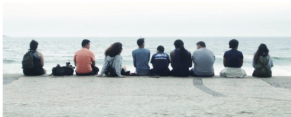
JAS YouthBuild students on an international service trip to Rio de Janeiro, Brazil.