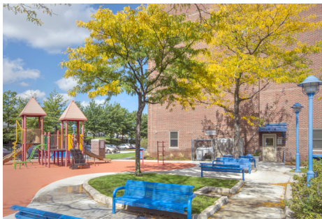
New outdoor space at 402 Rindge