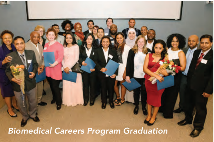
Biomedical Careers Program Graduation