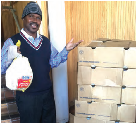
Free turkeys for Thanksgiving for the residents!

JAS Resident Events: JAS's Resident Services program, working with Wingate Companies and Maloney Properties, has events throughout the year that bring everyone together to share holidays, involve families in fun activities, and create opportunities for everyone to get to know each other! Activities include Family Fun Day, a BBQ, Winter Wonderland, and Thanksgiving dinner.