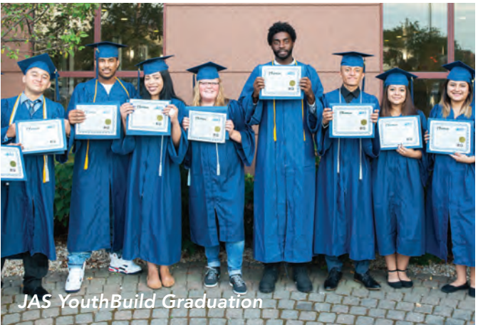
JAS YouthBuild Graduation