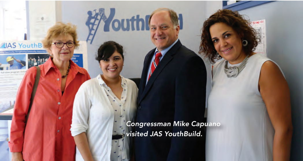
Congressman Mike Capuano visited JAS YouthBuild.

402 Rindge Rehab: Rindge Tower Apartments, a 273-unit affordable apartment building owned by JAS, was rehabbed in 2016, with significant improvements and upgrades to all the units, electrical wiring, and plumbing in the building. 402 Rindge now also has a renovated Community Room and a refurbished Computer Lab for the residents. MassHousing was a major partner in the renovations.