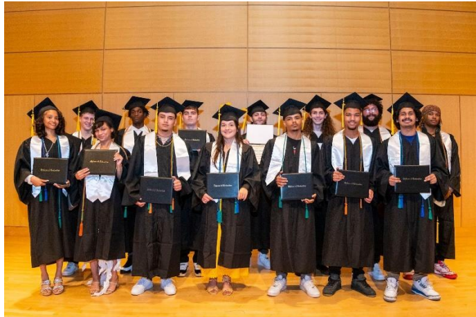
YouthBuild Just A Start Class of 2024 Graduates